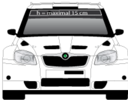
FRONTSCHIEBE LT. ARTIKEL 18.7.4 national