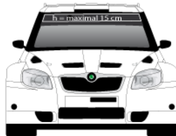
FRONTSCHIEBE LT. ARTIKEL 18.7.4 national